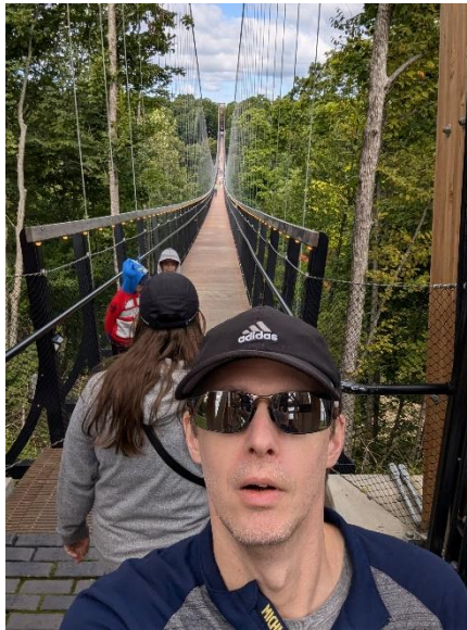
Boyne Mountain Sky Bridge, Boyne Falls, MI