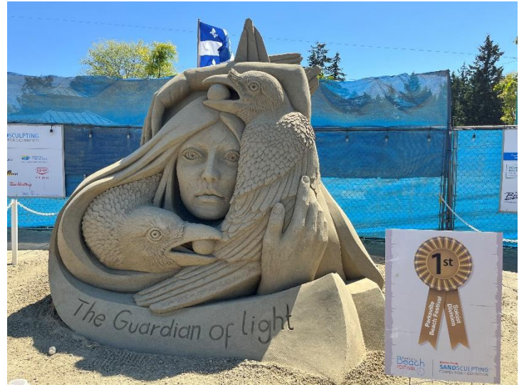
Vancouver Island, BC – Vivienne Outlaw