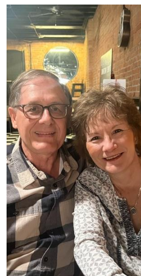
Dinner before a Tim McGraw concert, Toledo, OH