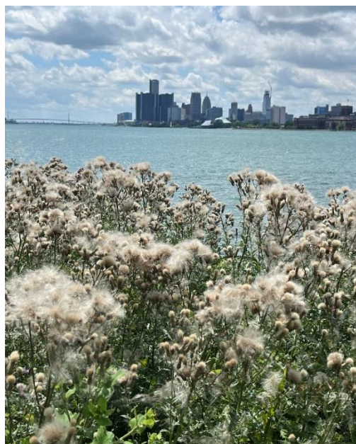
Beautiful view of Detroit, MI – Mouna Mana