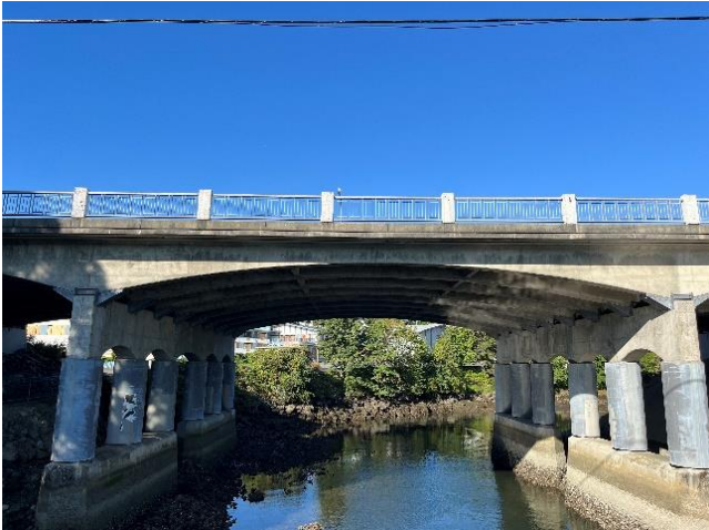
Vancouver Island, BC – Vivienne Outlaw