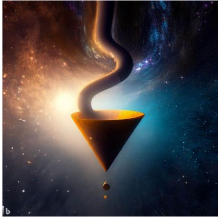
AI-generated image of a funnel, to represent the process of refining “prompts” for AI output, courtesy of Bing Image Creator