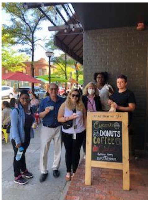
Our group at Bakehouse 46, 9/7/22

The ice cream walks were so much fun this summer. We ended up having to flex a couple of our destinations due to unexpected closures, but we pivoted like true champs!